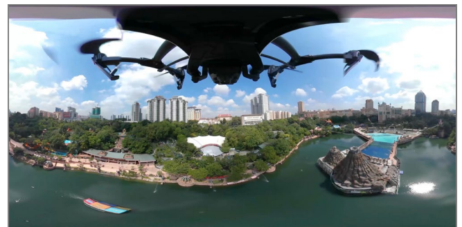
Fig. 4. Stitched image from the Samsung Gear 360.