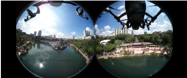
Fig. 1. Dual lens raw footage.

Manufacturers of 360-degree cameras can now be found anywhere. From Ricoh Theta, Insta 360 to Samsung Gear 360. All of these cameras are consumer level cameras that can be found anywhere for a very affordable price. These cameras are designed with dual fisheye lenses that is placed in opposite direction. The camera will then record simultaneously and resulted in a side by side footage of two lenses as per Figure 1.