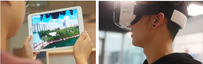
Fig. 9. Aerial 360 video with mobile tablet and HMD user experience.

shown in table 1. Answers were captured on a Likert scale of 1 to 7 in which 1 was “strongly disagree” and 7 “strongly agree”. Our key interest was to understand the perceived ease-of-use and usefulness of the prototype by the participants, and how they described their experience with our system.