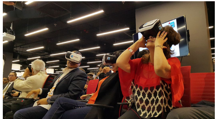
Fig. 7. Example of a figure caption.

The final result of the prototype in the form of 360 video have been used for a corporate event launch as an experimental use case as shown in Figure 7 and Figure 8.